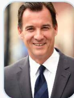
Congress Member Thomas Suozzi