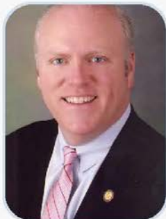
Congress Member Joseph Crowley