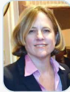
Honorable Melinda Katz