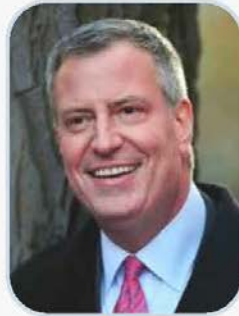
Mayor Bill de Blasio

Human First salutes and welcomes the unwavering support of our leaders and partners in government and their commitment to people with special needs Thank you for the citation