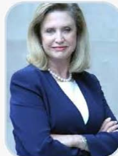
Congress Member Carolyn B. Maloney