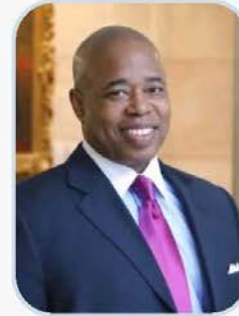
Honorable Eric Adams