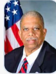
NYS Senator Leroy Comrie