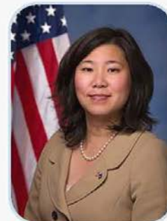
Congress Member Grace Meng